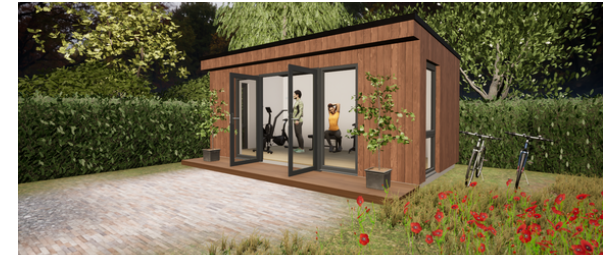
Illustrative Images of Model D. Dimensions: 3m x 6m

Shown below is our Model D design which provides ample space for exercising at home.