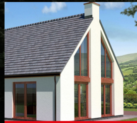
TIMBER FRAME KIT HOMES