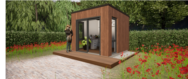
Illustrative Images of Model B. Dimensions: 3m x 3m.

Shown below is our Model B design which offers generous room for your creative materials and additional furnishings.