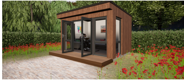
Illustrative Images of Model C. Dimensions: 3m x 4m.

Shown below is our Model C design which offers generous space for entertaining guests, indulging your hobbies or creating a games area for children.