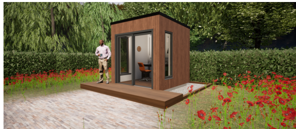
Illustrative Images of Model A. Dimensions: 2.5m x 2.5m.

Shown below is our Model A design which is comparable in size to a small bedroom yet it offers a comfortable and spacious workspace.